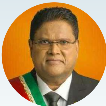
Mr Chandrikapersad Santokhi President of the Republic of Suriname